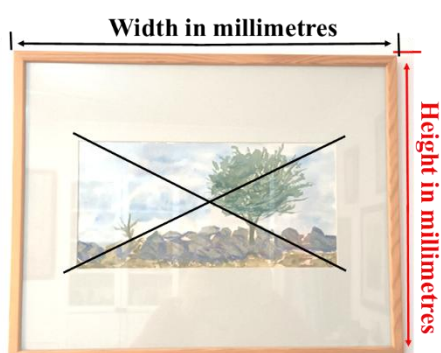
Measuring Your Artwork (Fig. 1)