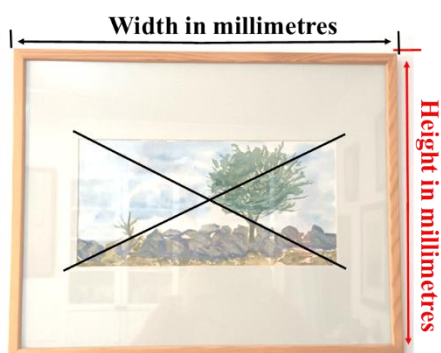
How to Measure Your Artwork (Fig. 1)